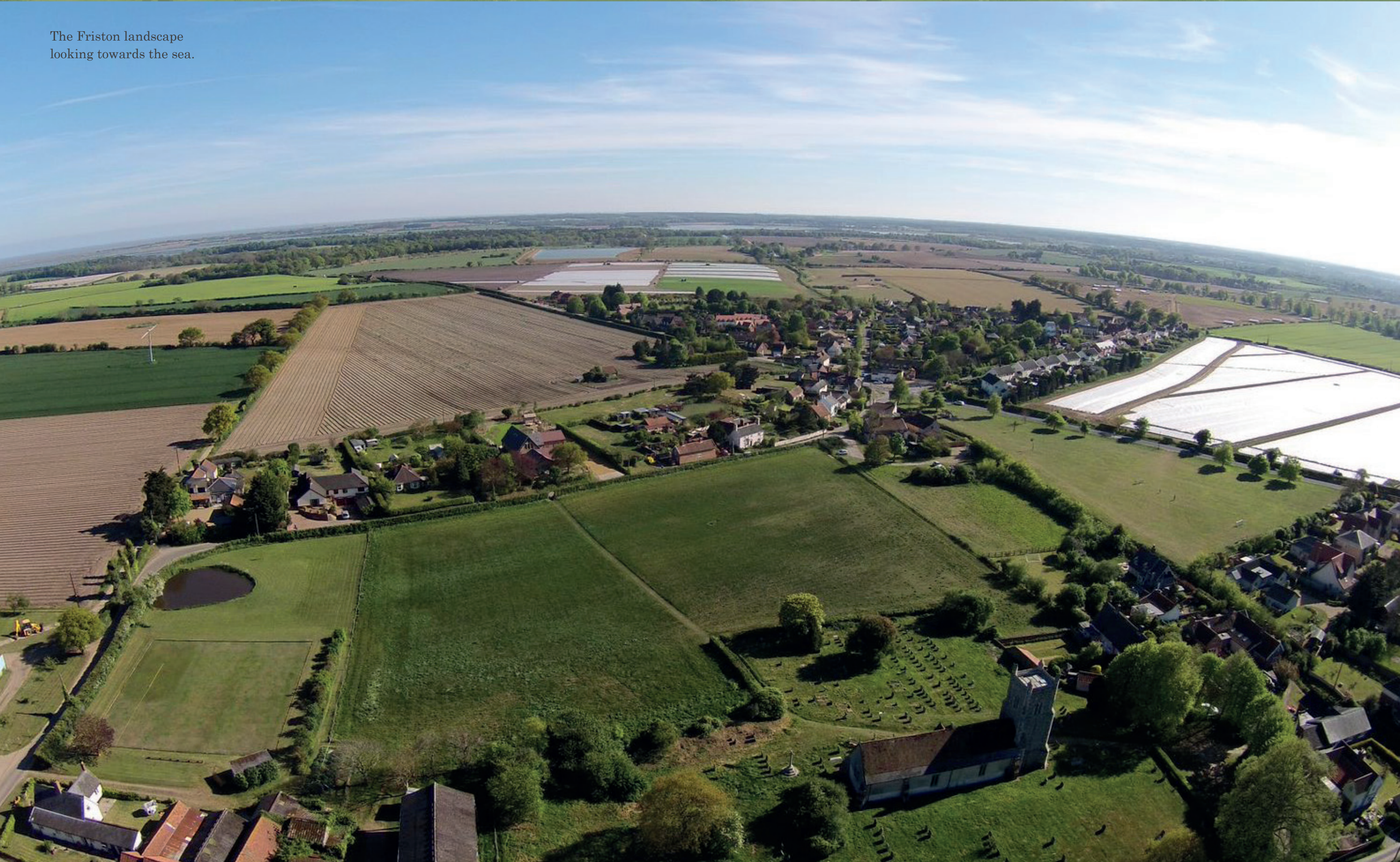
The Friston landscape looking towards the sea.